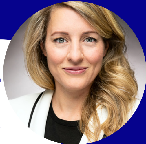
The Honourable Mélanie Joly

Mélanie Joly is a Canadian lawyer and politician. A member of the Liberal Party of Canada, she has been Minister of Foreign Affairs in Justin Trudeau's cabinet since October 26, 2021. She was named Young Global Leader at the World Economic Forum. She is recognized for her commitment to inclusion, gender equality and diversity, while playing a leading role in the Canadian government.