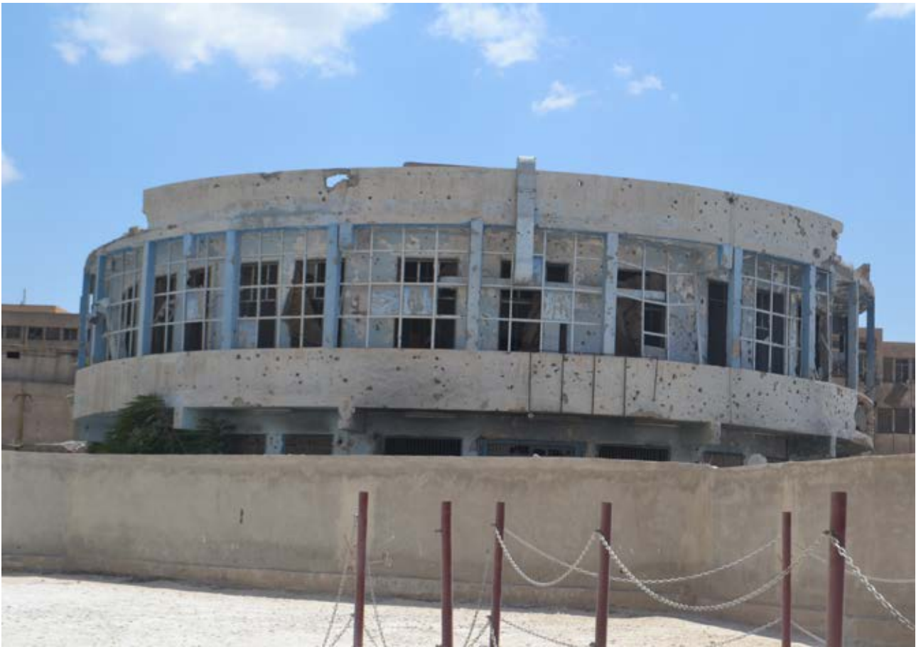
Syria, 2019