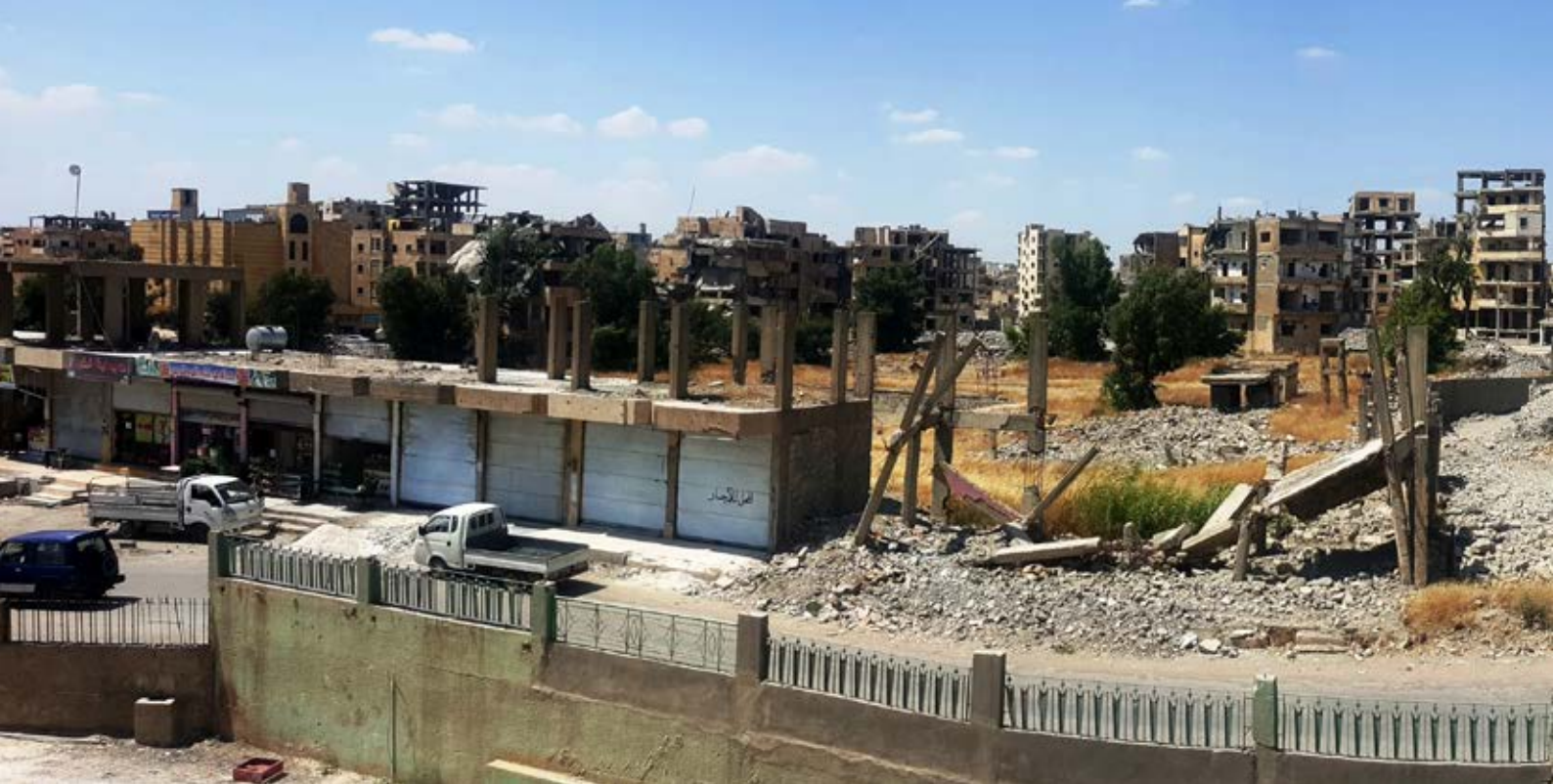
© A. Taslidžan Al-Osta/ HI - Syria, 2019