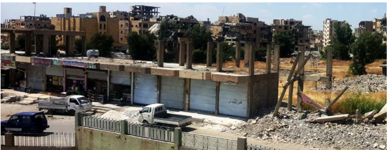
© A. Taslidžan Al-Osta/ HI - Syria, 2019

HI is calling on all States to support the development of a strong political declaration to end the harm caused by the use of explosive weapons with strong provisions for victim assistance.