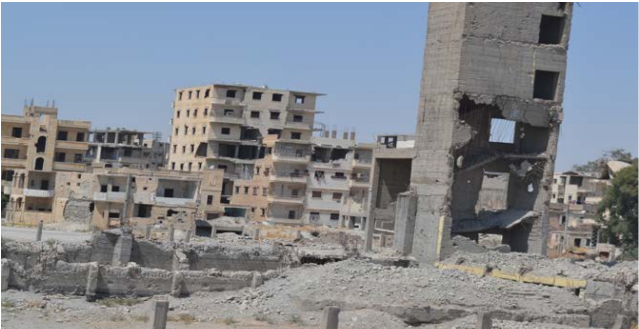
© Bahía.Z / HI - Syria, 2019