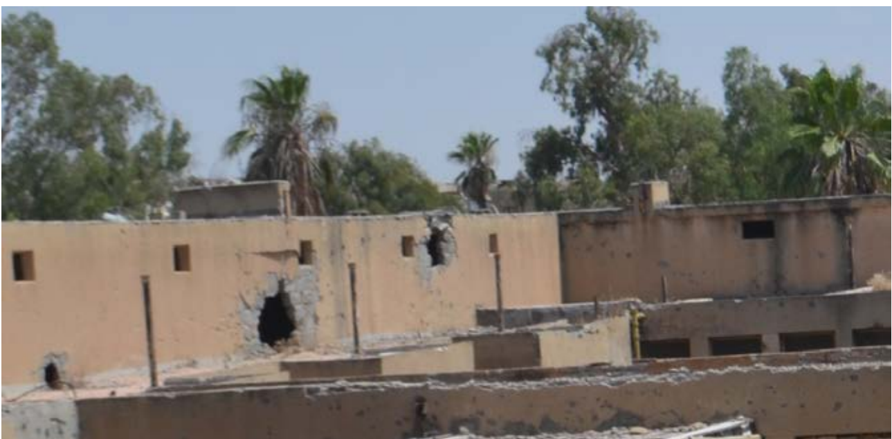
© Bahia.Z / HI - Syria, 2019