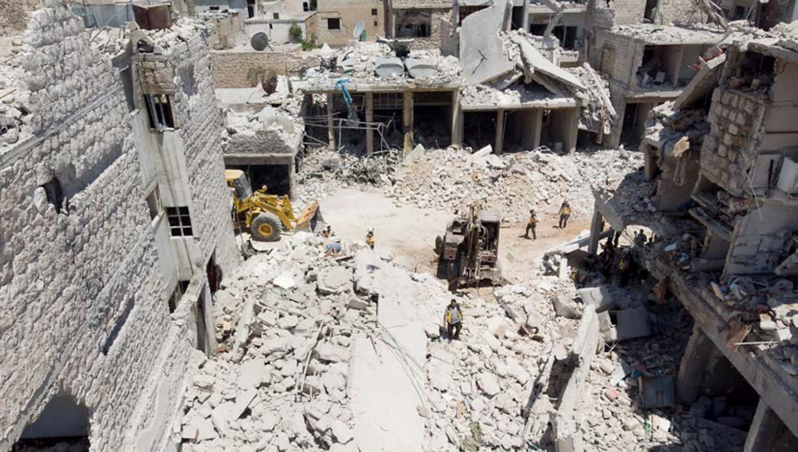
Syria, 2019

school dropout rate reached almost half of all students (44%), compared to gross enrollment rates in Syria of 91% in 1996. 114 The impact of this “lost generation” will be felt in Syria for decades to come.