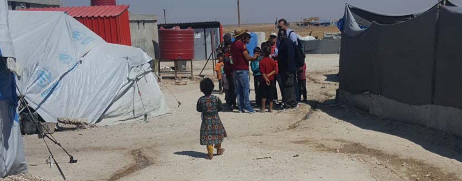
© A. Taslidžan Al-Osta/ HI - Syria, 2019