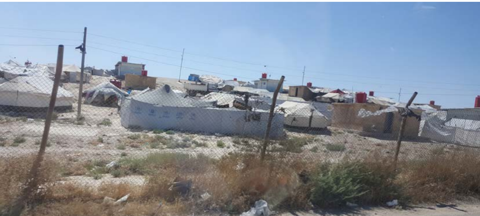
© A. Taslidžan Al-Osta/ HI - Syria, 2019

bombardment forced hundreds of thousands of Syrians to flee. 31 Many travelled to the last opposition stronghold of Idlib in the northwest, where at the time of writing over 3 million people are in need, and bombardments have reached almost daily frequency despite peace agreements. 32 The northeast of the country is held in part by the Kurds who, with the support of coalition airstrikes, defeated ISIS in Raqqa.