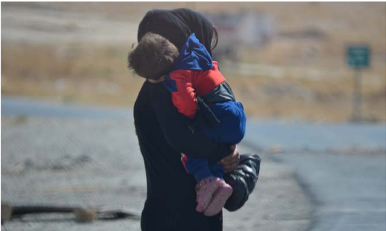
© Bahía.Z / HI - Syria, 2019